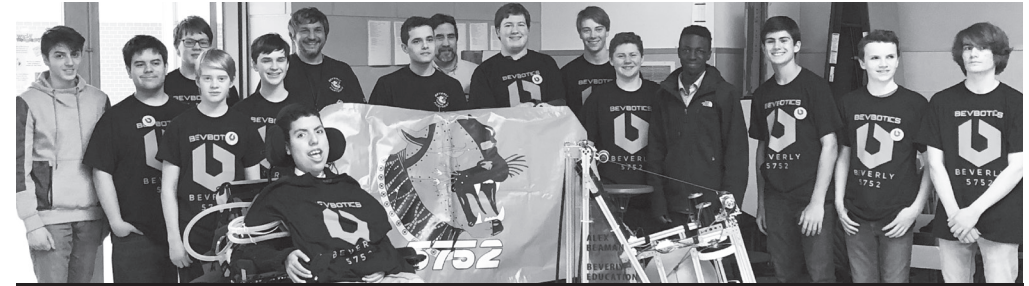
Beverly Robotics team Thanks